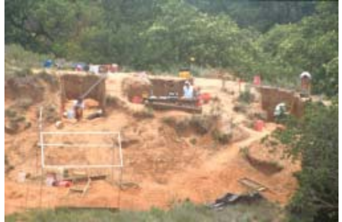
OU Field School students working at the Jake Bluff site, Harper County, Oklahoma.

The Flying W Guest Ranch (owners of the Certain site)