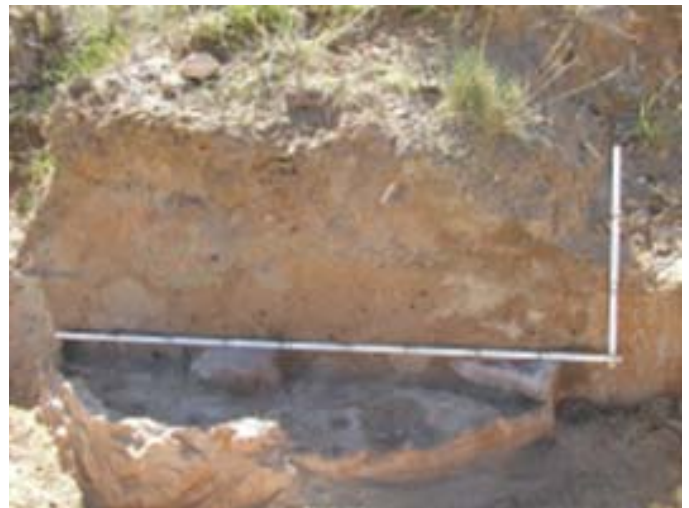
Profile of the pit from the Smith #2 site, Harper County, Oklahoma.

points and cordmarked pottery yielded a radiocarbon date calibrated to AD 700 and confirms the Woodland period age of the site. Additional work at the site is needed to