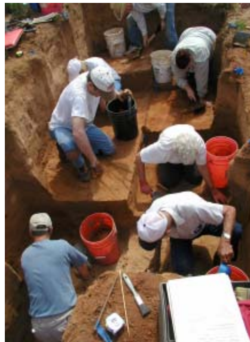
OAS members excavating at the Jake Bluff site in Harper County, Oklahoma.