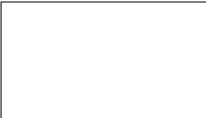
Figure 1. Dancers at the traditional Caddo dances, March 15.

On Saturday evening, a traditional Caddo meal and dances