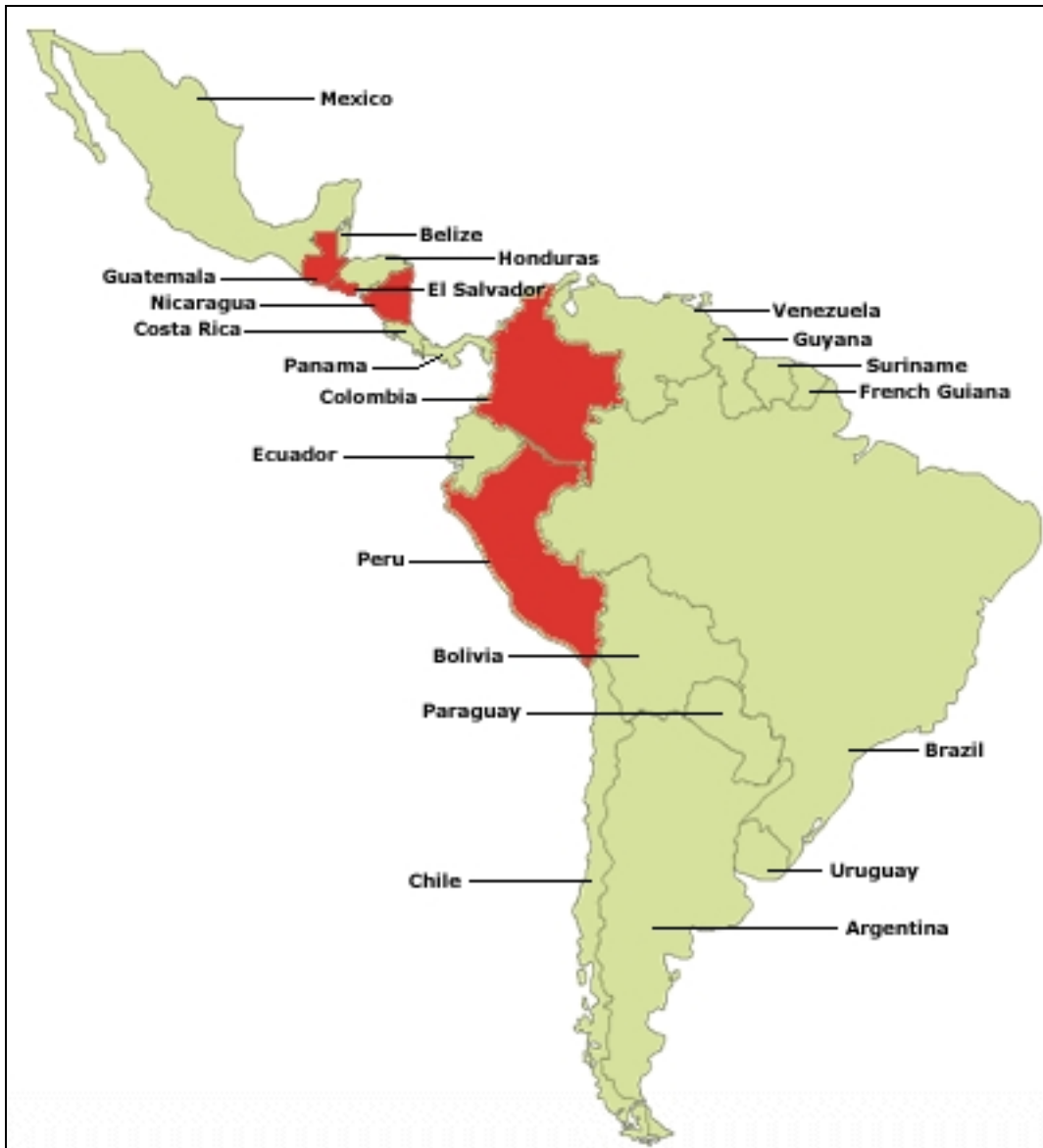
Figure 1 Bad Neighborhoods in Latin America (1971-2000)

Source: www.ftaconsulting.com/images/map.gif *Bad neighborhoods in red (modification)