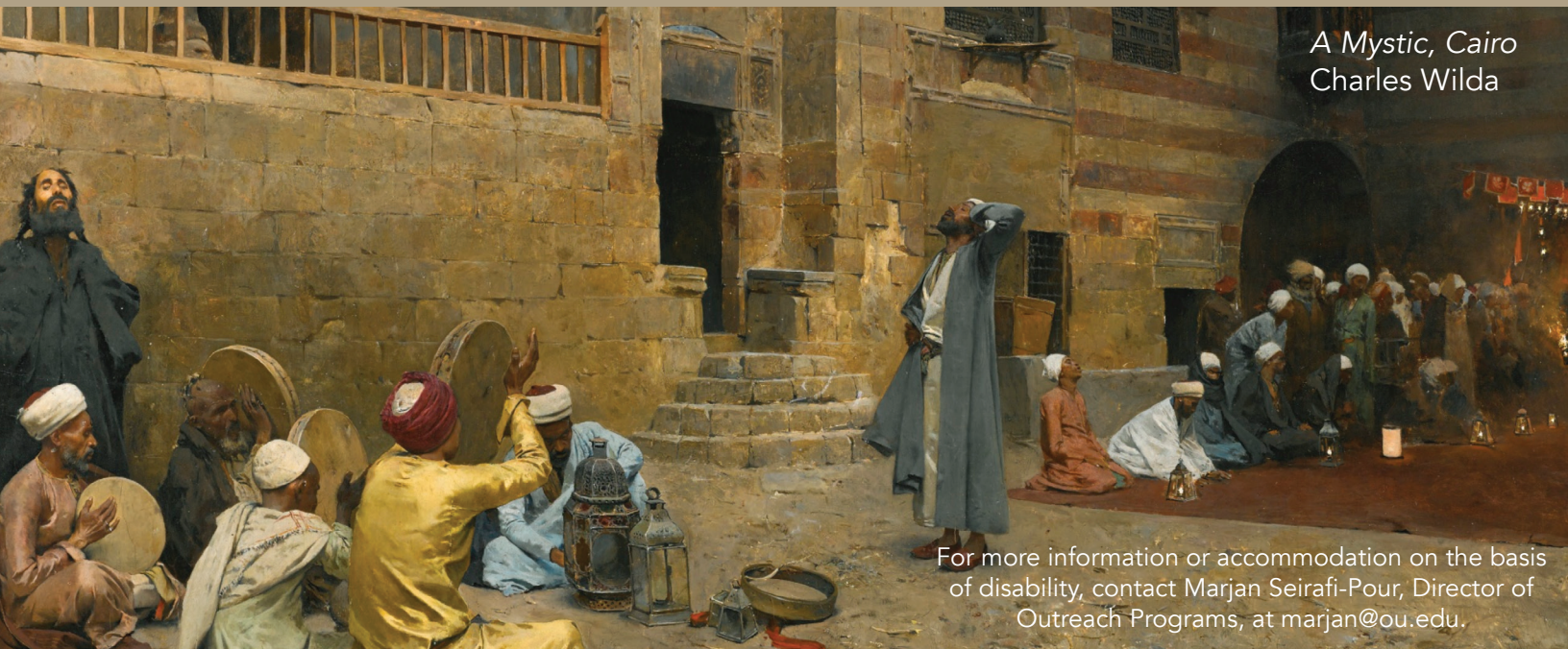
A Mystic, Cairo

CENTER for MIDDLE EAST STUDIES College of International Studies UNIVERSITY of OKLAHOMA