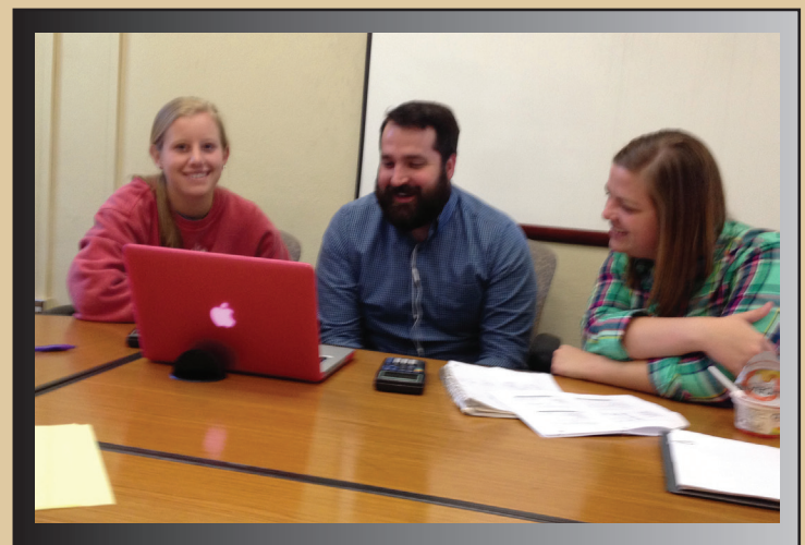
Around Price College -- (left) working together on a community service project; (above) students access the Action Learning Center, set up to enhance the learning experience for introductory finance and managerial accounting classes