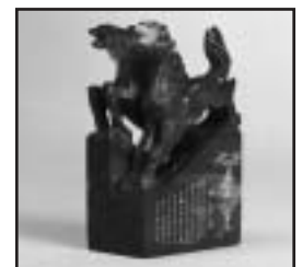
Souvenirs and images (left and above) from the Oklahomans' trip to China.