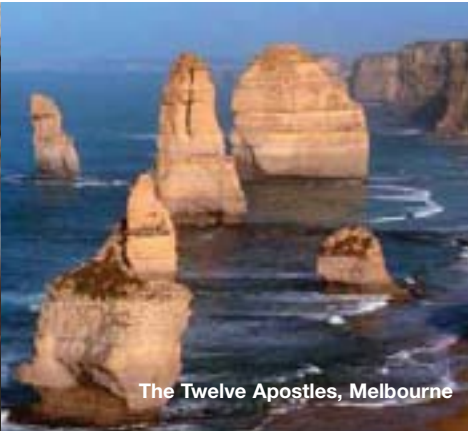
The Twelve Apostles, Melbourne