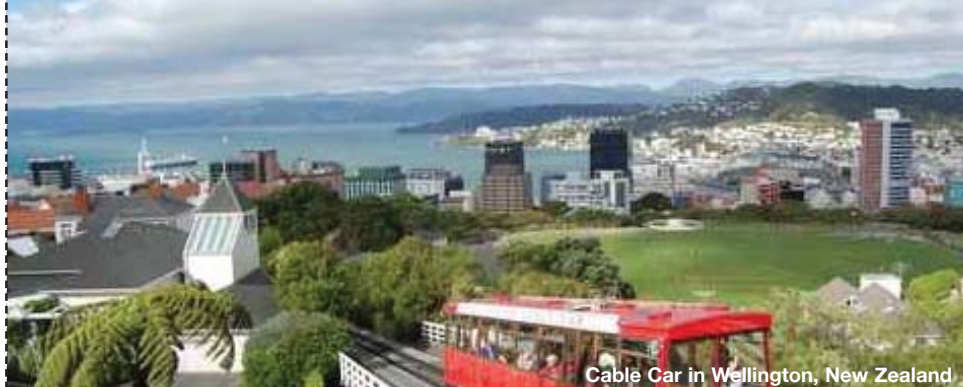
Cable Car in Wellington, New Zealand

All passengers must have a valid passport with at least 6 months validity remaining at time of travel.