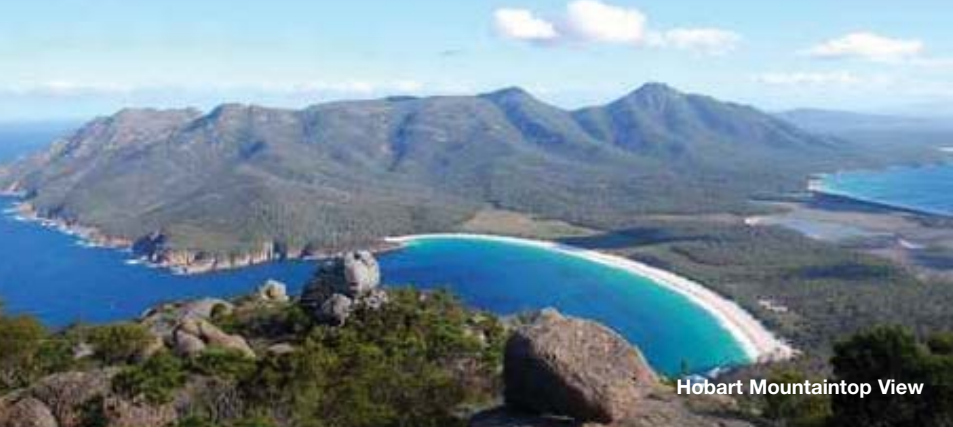
Hobart Mountaintop View