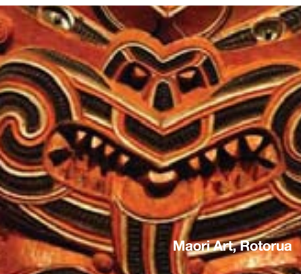
Maori Art, Rotorua

Many other departure cities are available for an additional fee of $199 including: Des Moines, Fargo, Kansas City, Milwaukee, Oklahoma City, and St. Louis. Call for a complete listing. All airfares are in coach class.