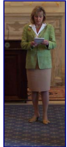
Lt. Gov. Mary Fallin