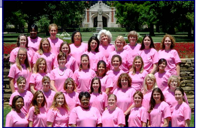
N.E.W. Leadership Class of 2005