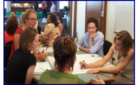
True Colors Workshop