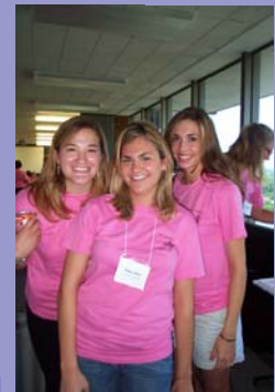
Students meeting new friends!

Educating, Inspiring, Empowering Women to Become Political Leaders