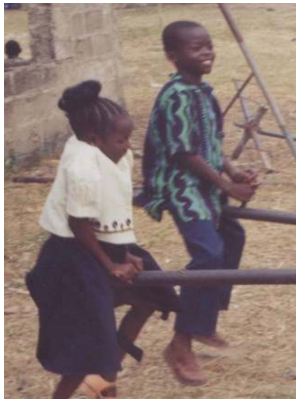
Children at play, Nigeria.

Exotic animals such as zebras, gorillas, or cheetahs roam these rolling plains and lush greenery. The