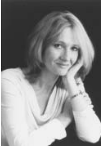
J. K. Rowling, 2001

Rowling has planned seven volumes, one for each of Harry's years at Hogwarts. In the first book of the series, Harry, his best friend Ron Weasley, and the brainy but slightly priggish Hermione Granger succeed in capturing the sorcerer's stone from the evil Lord Voldemort (He-Who-Must-Not-Be-Named), Harry's archnemesis, the murderer of his parents, and the one responsible for the scar on his forehead. Harry returns to Hogwarts for his second year in Harry Potter and the Chamber of Secrets . As the year commences, a pall of suspicion cloaks the school as students are turned to stone under bizarre circumstances, and Harry and friends must discover the culprit. As the third book, Harry Potter and the Prisoner of Azkaban , begins, the vile criminal Sirius Black has escaped from the wizard prison of Azkaban and is feared to be headed toward Hogwarts and Harry. However, things are not as they appear. In a strange turn of circumstances, Harry and his friends discover the truth about his father, his godfather, and