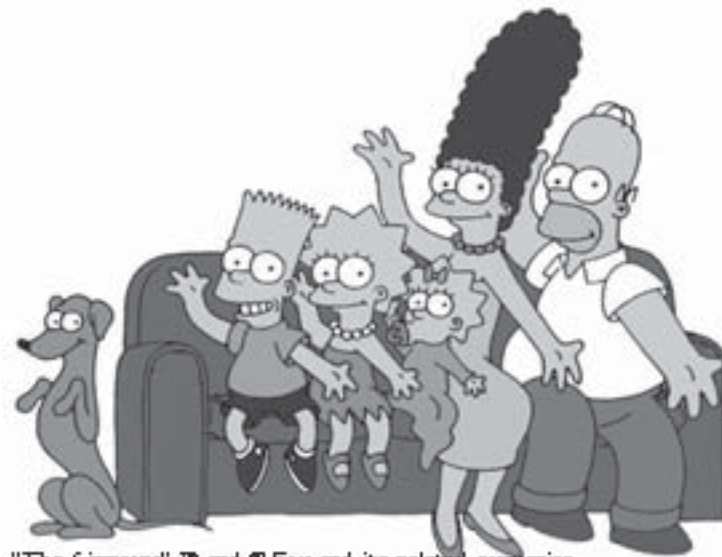
"The Simpsons"™ and © Fox and its related companies.

Then there's Ned Flanders. Ned is kind of nerdy, but he truly is a Christian. This Oral Roberts University graduate is ridiculed and made fun of. But to his credit he is the sincerest form of Christian seen on television today. No matter how poorly Homer treats him; Ned al-