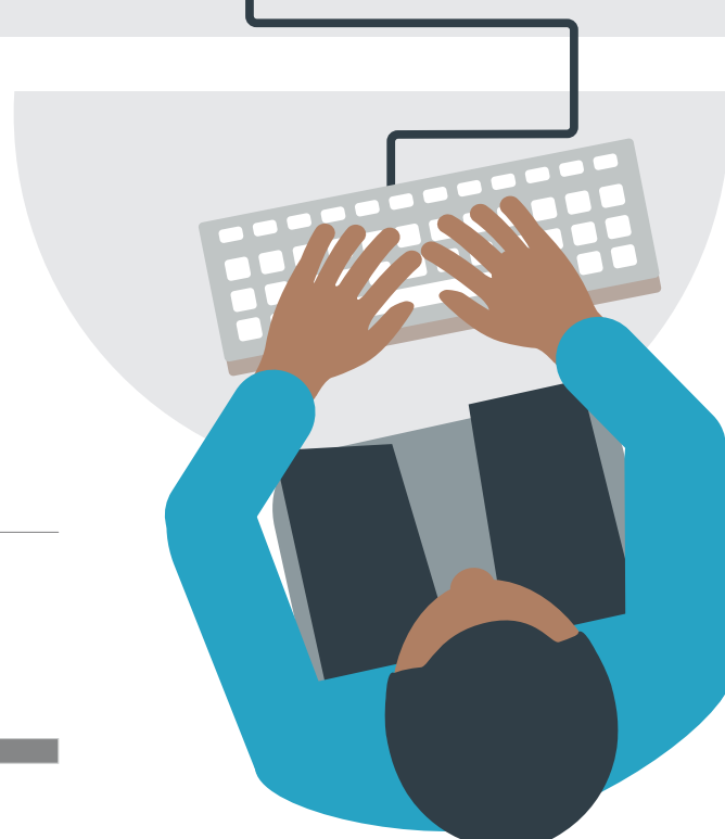
Computer Person Adapted from design by iconicbestiary / Freepik