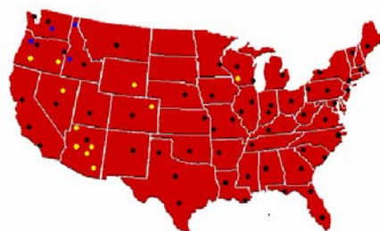
Figure 3. Raw materials and potential plant locations

maximum potential achieved if p_1=p_2 , and \gamma_{at} such that the negative effect of the highest price ( p_1=p_{1,\max} ) is equivalent to a=\$50,000 at year 10. Only 3 choices of price were given ( 0.975p_2 , p_2 and 1.025p_2 ). With these parameters, when considering Phoenix, the model puts one plant with a small capacity at first, building up to full capacity (15,000) in year 7, using only about 1.25 million of the 1.5 million