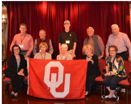
Great Pacific Northwest