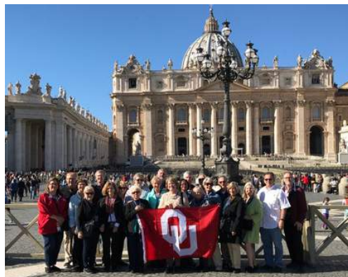
Portrait of Italy