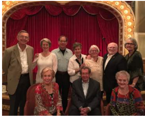
Country & Blues