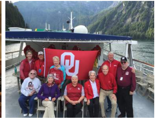
Discover SE Alaska