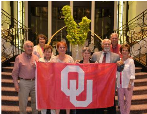
Essence of the Atlantic