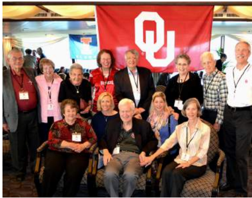
Baltic & Scandinavian Treasures