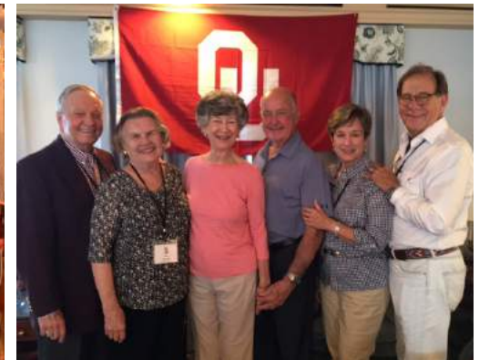
Majestic Great Lakes