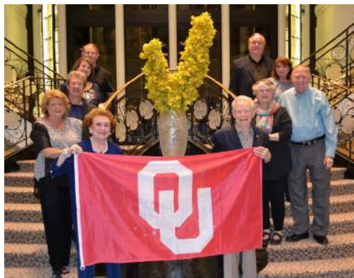
Regal Routes of Northern Europe