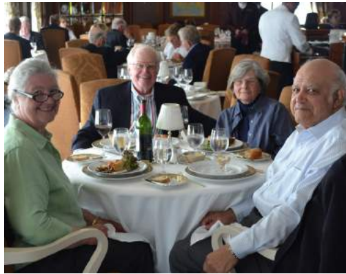
Cloisters & Courtyards