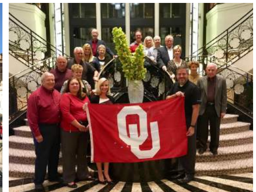
Mediterranean Pathways & Piazzas