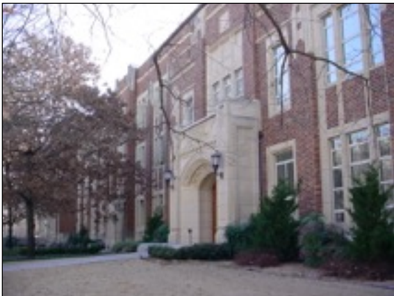
Nielsen Hall, home of the Homer L. Dodge Department of Physics and Astronomy

Your donations to our General Fund are used to support such critical departmental activities as physics and astronomy conferences on the OU campus; high-profile colloquium speakers; programs for women and minorities; outreach; alumni reunions; faculty and student research; postdoctoral fellows; graduate research assistants; and newsletter publication. The two major immediate needs are the building and a buy-in to a national telescope. Remember, what you give to the department stays in the department. Go to https://www.nhn.ou.edu/friends-alumni/donate for details.