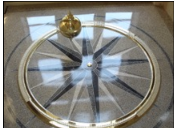
Foucault pendulum, located in the Nielsen Hall atrium, where tea is served each weekday from 3:30 to 4:00 pm.