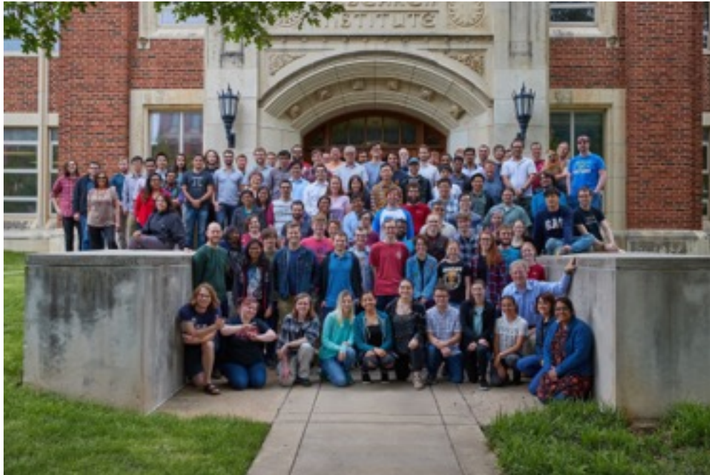
Members of the Homer L. Dodge Department of Physics and Astronomy, May 2019.