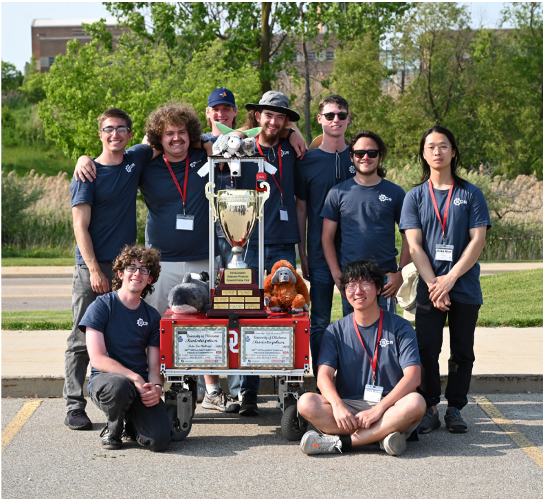
Sooner Competitive Robotics team at the 32nd Annual Intelligent Ground Vehicle Competition in Rochester, Michigan where they placed 1st in the Auto-Nav Challenge and won the Auto-Nav Grand Award, the Lawrence Cup.