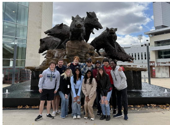
Cybersecurity Club traveled to Razorhacks at the University of Arkansas.