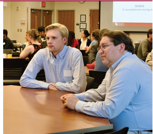
A Holmes Leadership Associate and mentor listen during a roundtable discussion.