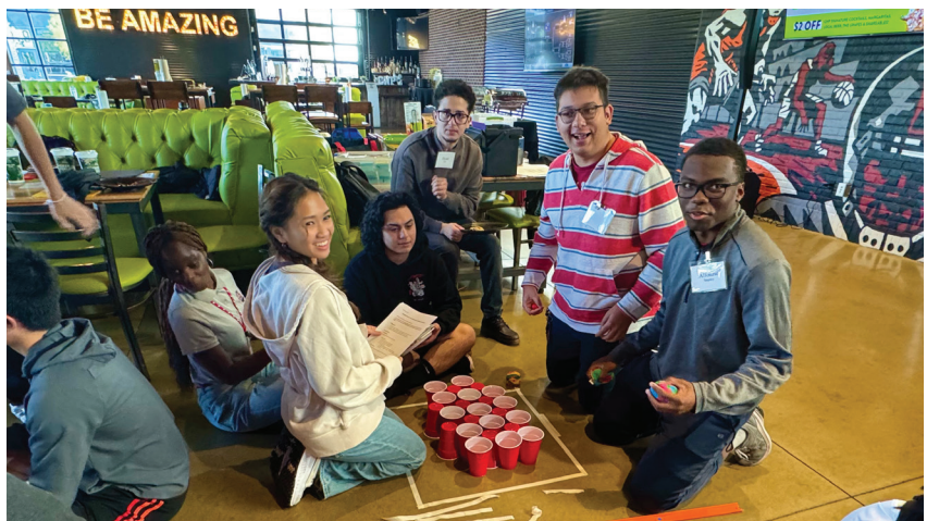
Retreat participants learn collaboration skills through design-build activities.