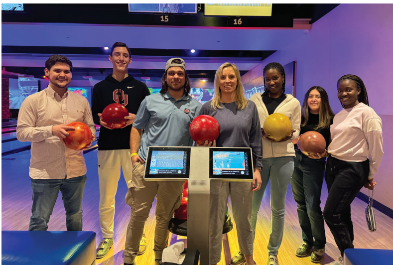
Holmes Leadership Associates start the spring semester with a social event.