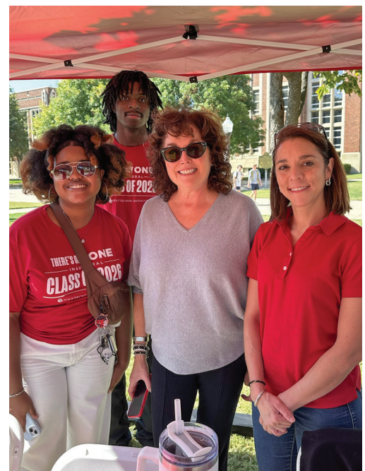
OUPI staff and OPAL members sharing OUPI opportunities with future students on the South Oval in Norman.