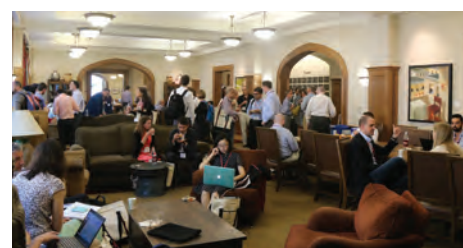
Price Hall's Dodson Lounge was a favorite spot during breaks