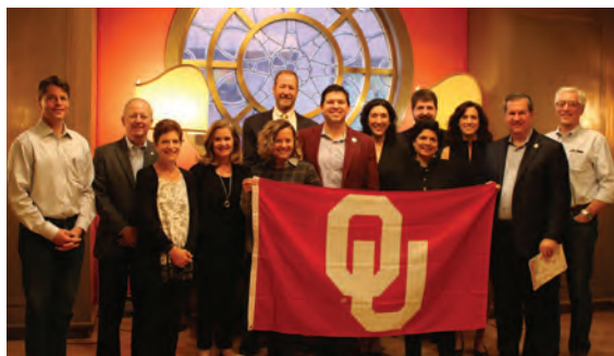
The group gets ready to "plant the flag" at the OU Club of New York's watch party.