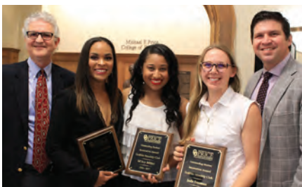
The founders of DollHer Monthly Club