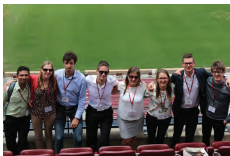
Conference attendees have lunch and a tour at the Gaylord Family - Oklahoma Memorial Stadium

During the 2017 summer, Price College hosted what is widely considered the premier conference for entrepreneurial research. The 37th annual Babson College Entrepreneurship Research Conference brought more than 300 researchers to the Norman campus from 25 countries to present papers. Visitors from across the globe were treated to tours of campus and the football stadium, as well as evening receptions at Sam Noble Museum and the Oklahoma City Boathouse District that included entertainment unique to Oklahoma culture and history.