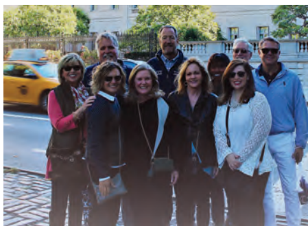
Beautiful autumn weather made for an informative walking tour of the city's Gilded Age.