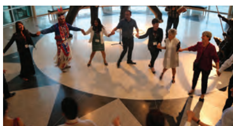
An opening dinner at the Sam Noble Museum included an introduction to a few Native American traditions