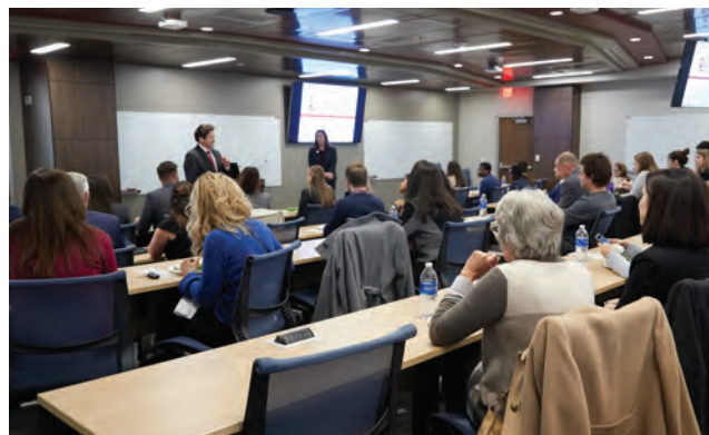
I-CCEW gives their fall 2017 final presentations at the Rainbolt Graduate School of Business in OKC

Beginning spring 2018, I-CCEW has its first team based out of the Gene Rainbolt Graduate School of Business. Partnering with the Stephenson Cancer Center, this multidisciplinary health sciences team will increase rural patient outreach. Additionally, the Tulsa campus is undertaking a project on detecting diabetic retinopathy in its early stages. Rounding out the expansion is the introduction of an Oil and Gas Exploration track for spring 2018 interns.