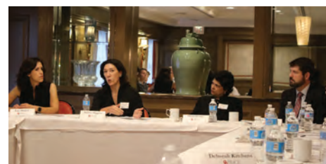
Independent board directors lent their expertise to the group during the Saturday brunch discussion about corporate board leadership.