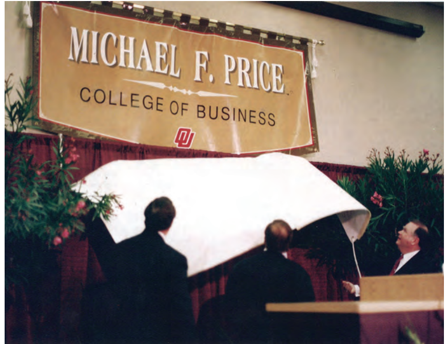
The unveiling of the newly-named Michael F. Price College of Business