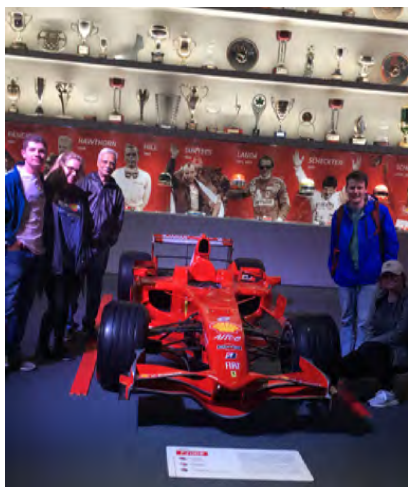
Ferrari Museum in Maranello