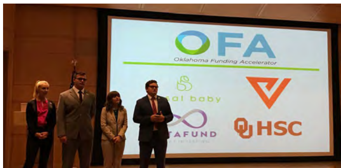
I-CCEW interns give end of spring presentations at Sam Noble Museum

OK Coders was founded in 2014 as a partnership between the Ronnie K. Irani Center for the Creation of Economic Wealth and local startup Tailwind to meet Oklahoma's growing demand for software developers. As Oklahoma's first developer bootcamp, it has now trained over 200 new developers in Oklahoma City and Tulsa. The programs are accessible to both professional developers and beginners with limited programming experience and cover a range of technologies and tools needed to build complete web applications and kick-start a career in programming. Three OK Coders boot camps were offered this spring, including the addition of an eight-week Data Analytics course that covers relational SQL database, how to break down analytical questions into small sub-problems, and how to solve each with the "R" programming language. Visit okcoders.com to learn more and sign-up for upcoming programs, making them the only undergraduate student team in the most challenging division to receive an award.