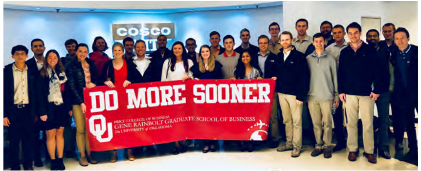
MBA students visit Cosco/HIT offices in Hong Kong