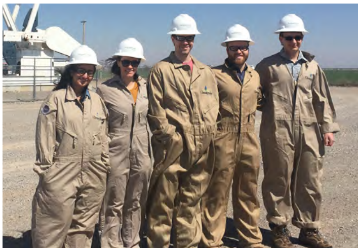
Chesapeake Energy's student consultants visit the field to continue their research and analysis before their final strategic presentation to the company

academic enterprises and commercial activities for economic impact."