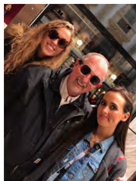
Milan Fashion Show

Price College continues to expand its study abroad opportunities for undergraduate and graduate business students. This spring semester, the Division of Marketing and Supply Chain Management launched its first semester-long study abroad program in Arezzo, Italy. Both lower and upper division courses in marketing and supply chain management are offered, including an internship abroad that is required of all students during their semester in Italy. Any business student, regardless of major, is able to earn a minor in marketing by participating in the new program.