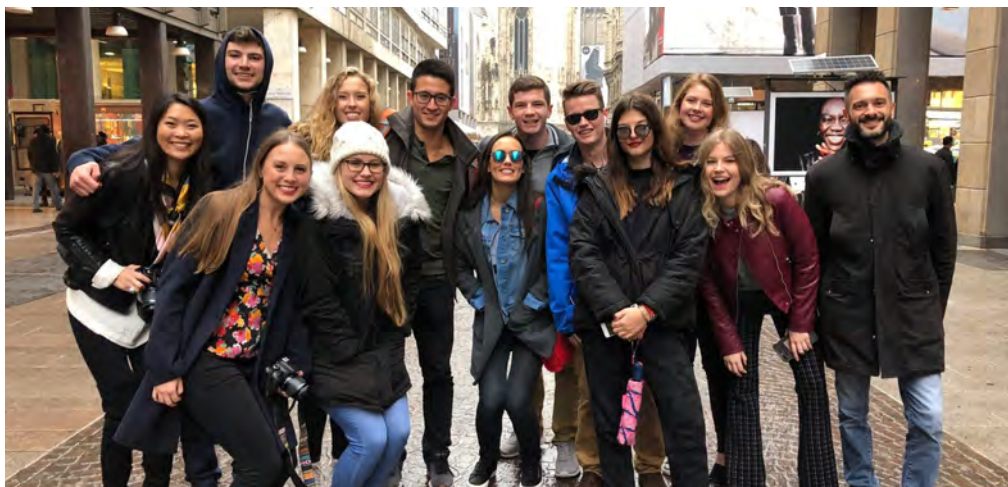
Milan Fashion Show