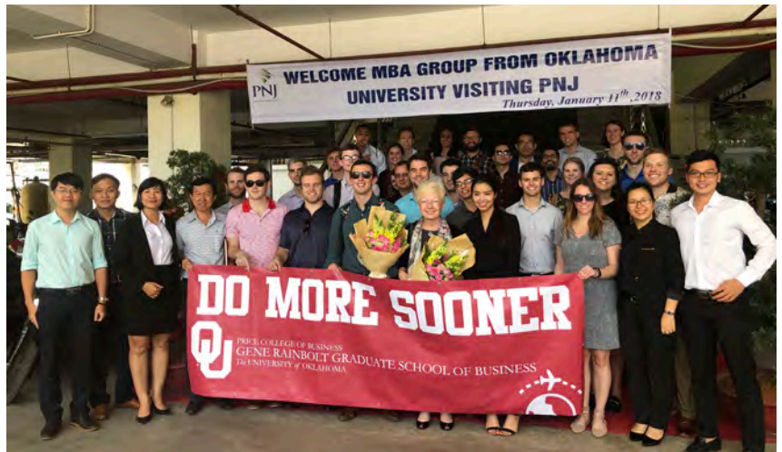
The MBA student group was given a warm welcome by PNG offices in Vietnam