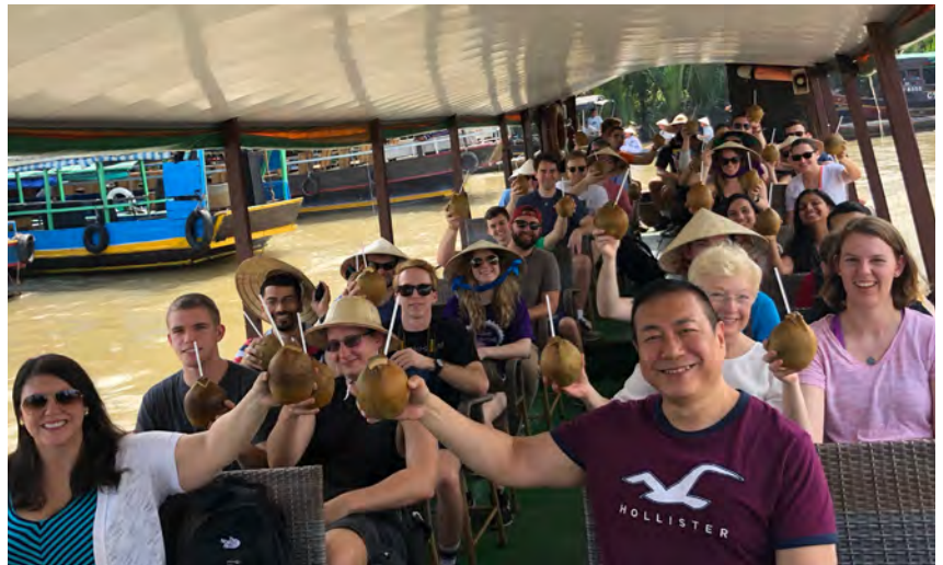
MBA students toast to a successful trip to Southeast Asia as they float the Mekong