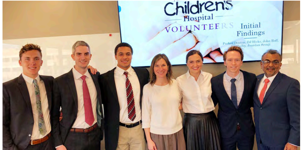
Full-time MBA student consultants work with the Children's Hospital Volunteers organization throughout the year that includes both sweat equity and applying their classroom knowledge to provide initial findings and final recommendations to improve processes