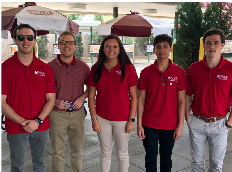
Full-time MBA student strategy consultants for SONIC make an on-site visit to one of the many locations across the country