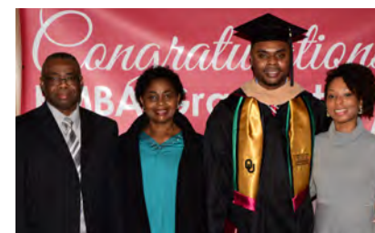
Families celebrate at the EMBA in Energy graduation reception