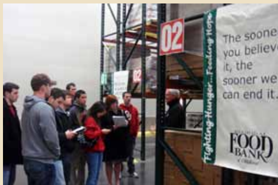
Supply Chain Management students tour the large facility at the Regional Food Bank of Oklahoma.