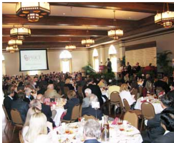
The Molly Shi Ballroom at Oklahoma Memorial Union provides a nice atmosphere for the Third Annual Honors Luncheon.