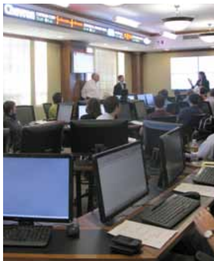
The Business Information Computation Laboratory serves as a trading floor, computer lab and classroom.

Fall 2009 marked the installment of the new 1,500-square-foot Trading Room in Adams Hall. The Trading Room features state-of-the-art datasets (including Bloomberg and Capital IQ), 32 computer stations and an impressive 36-foot-long, eight-color LED ticker display. The content featured on the ticker is remotely handled by Rise Display so students can check out stock information of Oklahoma public traded companies and worldwide financial market indexes.