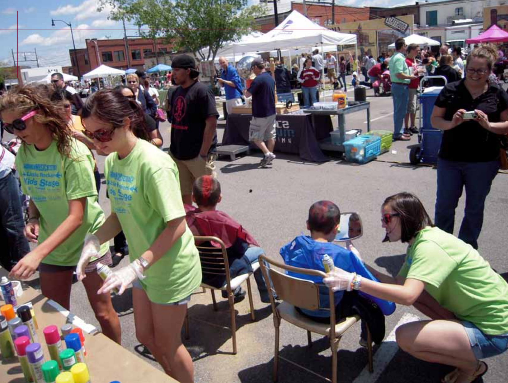
First Fidelity IBC students in the Boomer Tumbler Company assist with the children's area of the Norman Music Festival in April.