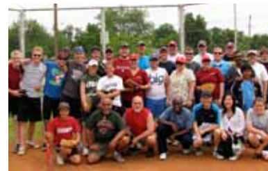
MIS students and faculty after an exciting and close softball game.

Rotary Park in Norman. The afternoon included hamburgers, hot dogs and plenty of friendly trash-talking between the two teams. The faculty team won the seven-inning game 14 to 10. Both the MIS students and faculty look forward to the game becoming an annual event.