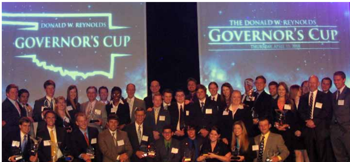
Everyone at OU involved with this year's Governor's Cup teams gathered together to celebrate the winners.