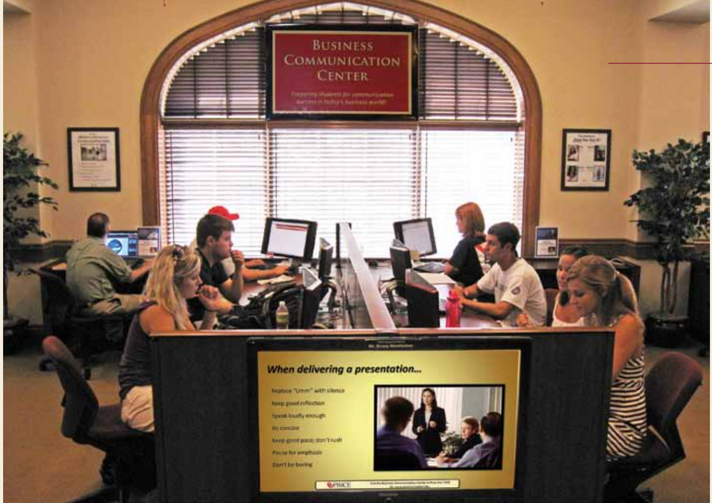
Students put the finishing touches on their team projects in the BCC's computer lab.

focus on rival top skills people pay to learn in the corporate world. “I am trying to equip undergraduates with an MBA level education in communicating information.”