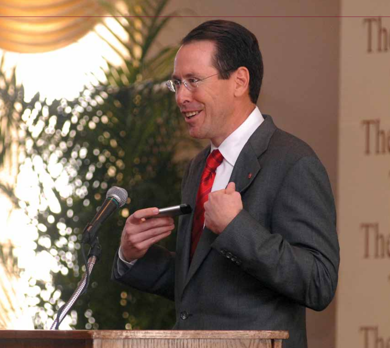
Randall Stephenson speaks to a large audience in Oklahoma Memorial Union during a visit to Price College in February 2008.

before. His focus on mobility and broadband access to the Internet has led AT&T to become a pioneer in wireless smartphones, wireless data and global business solutions. Over just the past two years, AT&T added more than 18 million wireless subscribers to reach more than 90 million. That growth came with rapid adoption of smartphones and data-capable wireless devices like the Apple iPhone, for which AT&T has exclusive U.S. service rights.