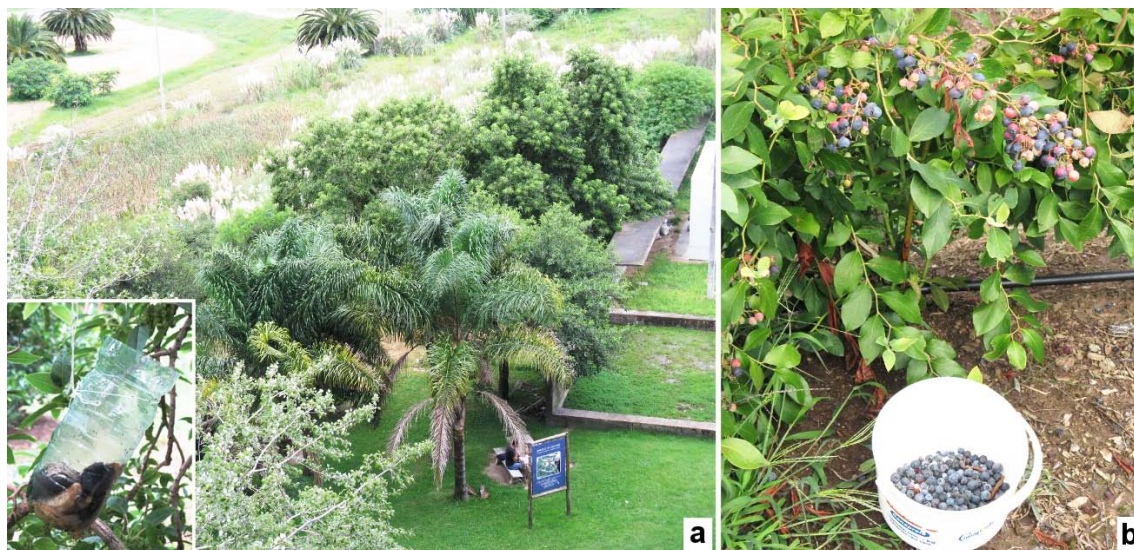
Figures 2. (a) View of the Native Flora Garden of the Facultad de Ciencias at Montevideo and banana-baited trap used for collecting flies (left corner). (b) Blueberries of the “Ochlockonee” cultivar at Empalme Maldonado farm, Department of Canelones.

drosophilids from both localities were placed under uncrowded conditions in vials with minimal fly medium (agar-sugar-nipagin solution) and kept at 22°C in laboratory conditions until being analyzed. Adults were anesthetized with vapors of triethylamine, counted, classified by sex, and identified to species level using external morphology, and in some cases, by the inspection of male terminalia and preserved in ethanol 70%. The keys and/or illustrations of Freire-Maia and Pavan (1949), Brncic and Santibañez (1957), Spassky (1957), Heed and Russel (1971), Val (1982), Vilela (1983), Vilela and Bächli (1990), Moreteau et al. (1995) were used. Samples of male and female specimens used for species identification were labeled and deposited at the collection of Sección Entomología, Departamento de Biología Animal of the Facultad de Ciencias, Universidad de la República, Montevideo (Uruguay). Adult samples of D. suzukii from Uruguay were identified by the characteristic sexually dimorphic wing pattern, male foreleg sex combs, male and female terminalia (Bock and Wheeler 1972; Vilela and Mori 2014).