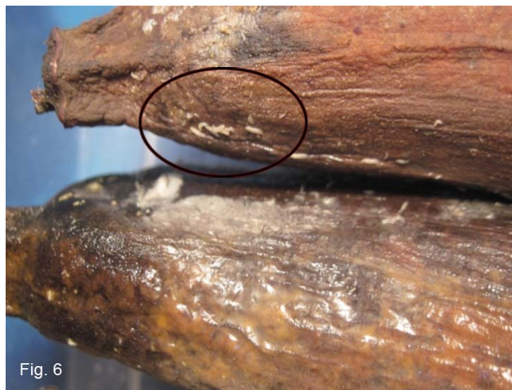
Figure 6. A possible cannibalistic aggregation observed in nature- growing on a banana in the wild.

Alternately, depriving both the species from normal diet and environment, as well as space limitation for considerable period ( D. virilis has also been cultured in the laboratory for some decades from now) might compel them to adapt cannibalistic approach, which thus might have originated as the product of parallel evolution in recent time after speciation. The alternative approach logically demands absence or lower rate of conspecific